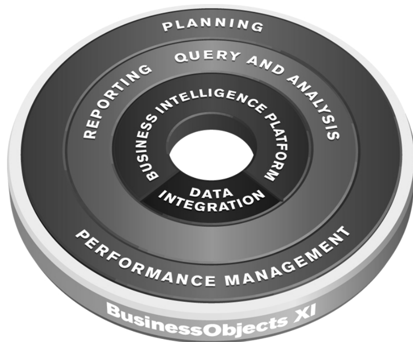
The Business Objects product line

■ Figure 2: Business Objects provides a broad range of functionality to cover the needs of all your user profiles.